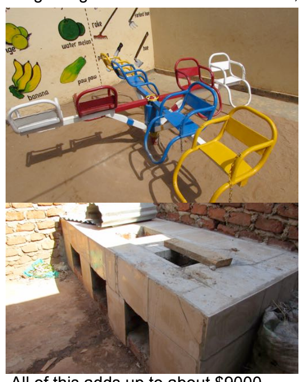
and uniforms and scholastic materials. All of this adds up to about $9000.

In addition to needing to complete the new school block, we need more funds to pay for teacher's salaries, housing, medical and food allowances. We need funds to purchase more food for the full term,